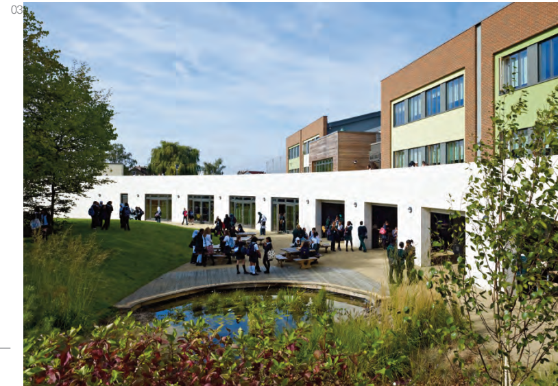
01 Original Edwardian facade 02 Axo showing central axis 03 New build dining space